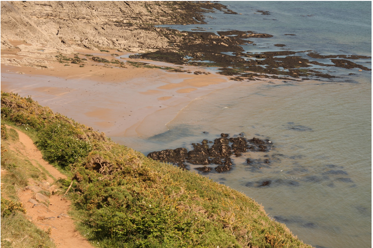
View from the coastal path above and below is Smuggler's Bay where the walk began.